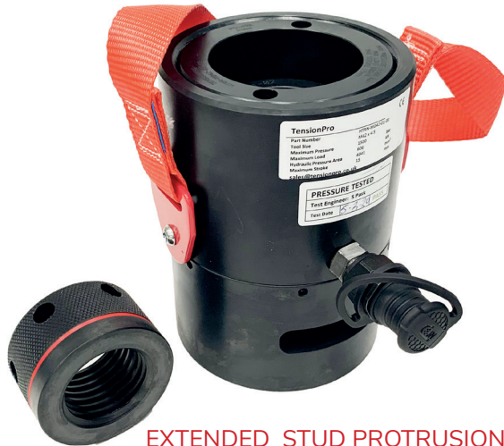
EXTENDED STUD PROTRUSION